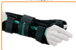
Thumb Wrist Splint