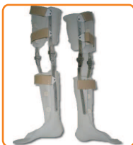
Knee Ankle Foot Orthosis