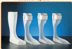
Ankle Foot Orthosis